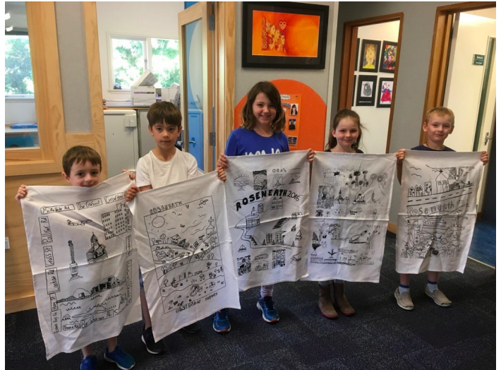
Linen tea towels for sale representing each House