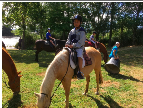
Year 7 and 8 students enjoying being with the horses on camp

Code camp allows kids from the ages of 7-12 to develop 21st century skills in computer coding by creating games, apps & working with robots. Find out more at www.codecamp.co.nz