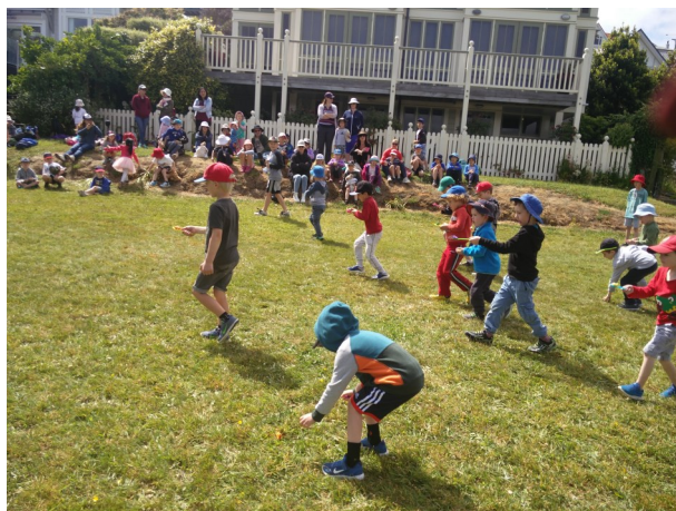
Teddy bear and spoon race EOTC for the junior/ middle school