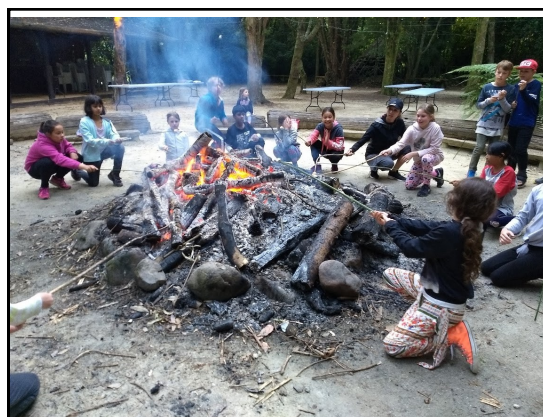
Year 5 and 6 students enjoying themselves at camp