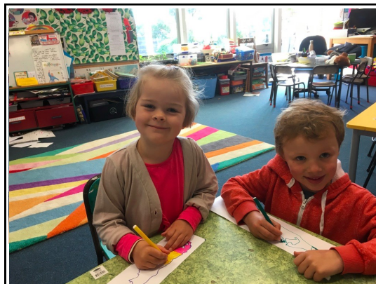
New in Aft