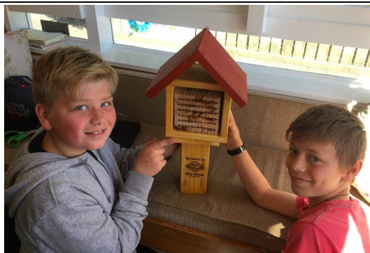
Pleased to have the leaf cutter bees

This week the BOT got together to rework the wording of our new charter. It was great to see that we are all on the same page but just some word-smithing was needed. We are now working on how to visually present this so we are in the process of engaging a graphic designer to help make it look professional and to capture the essence of this charter. Once we have the final draft completed it will be on display for final feedback.