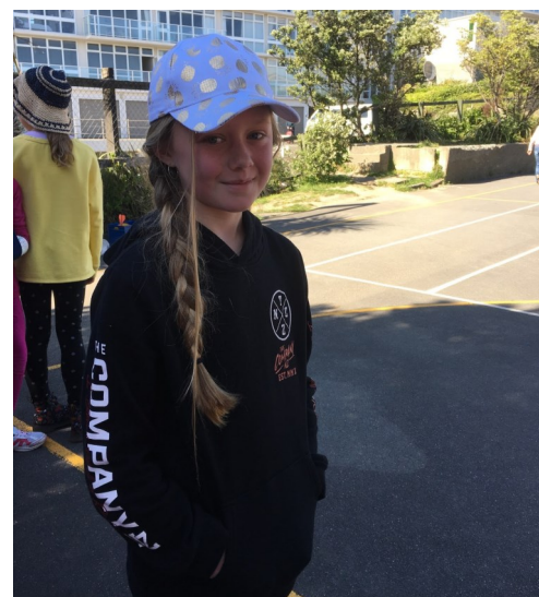
Beginning life at Roseneath School

We will confirm that we have received it, and might be in touch to discuss this further if need be"