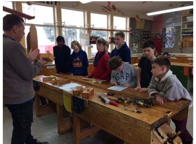
Yr 7/8 at Technology

These calendars, diaries and cards are beautiful keepsakes of your child's work and make excellent Christmas presents. Part of the price goes to the School so this is also an important way of supporting the School. Thank you. PS - The artist's name is at the bottom of the artwork.