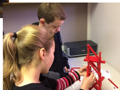
Year 7 and 8 students at technology—Mt Cook