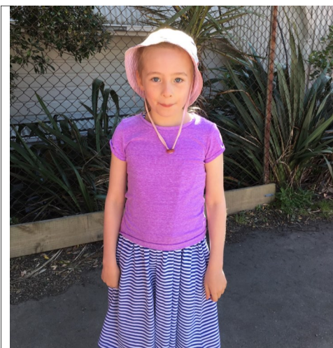
Pleased to be at Roseneath