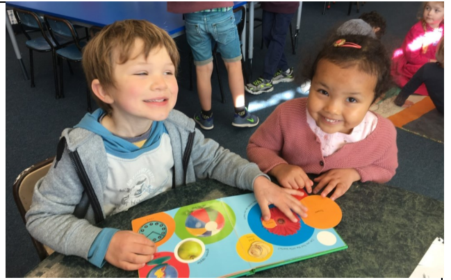
Having a great time at Roseneath

The next Friends meeting is on Thursday 26th October at 7.15pm at Roseneath School. Everyone is welcome.