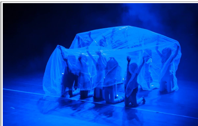
Dance Splash Performance at the MFC