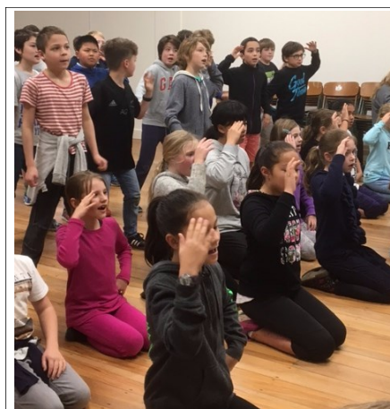
Kapa Haka practice