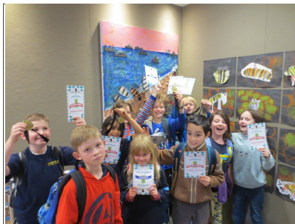
Victorious Chess team

None of this would be possible without the wonder teachers we have here at Roseneath. They truly deserve a well earned break before we embark on another action packed term.