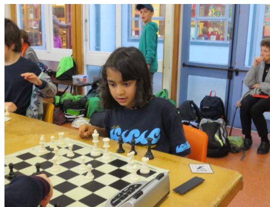
Concentration at Chess competition