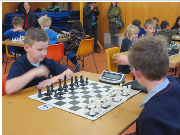
Deciding on a move

This is being held at 2pm in the School Library. We look forward to seeing as many parents as possible. If you know someone who is interested in Roseneath School or has a child turning 5 soon invite them along too!