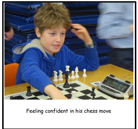
Feeling confident in his chess move