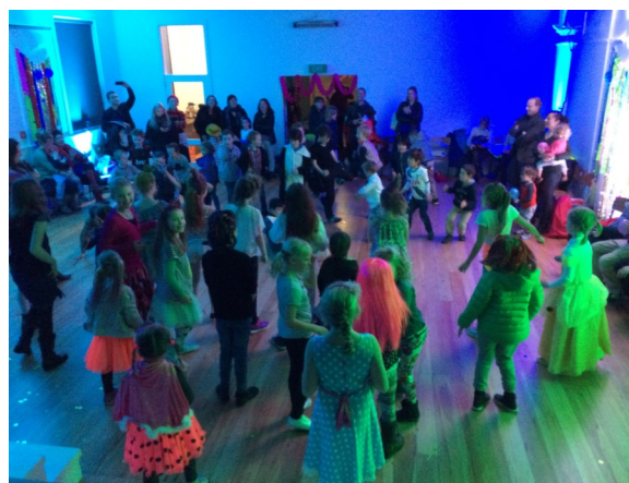
FRIEND'S successful Matariki disco in full swing

I look forward to hearing some of your thoughts on these dispositions/qualities. I will also be meeting with the House Leaders and Class reps to discuss this with them too.