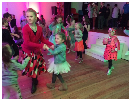
Showing off disco dance moves