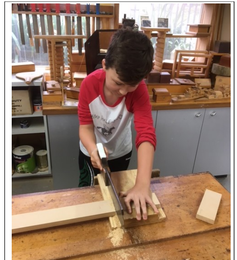
Senior student learning woodwork skills