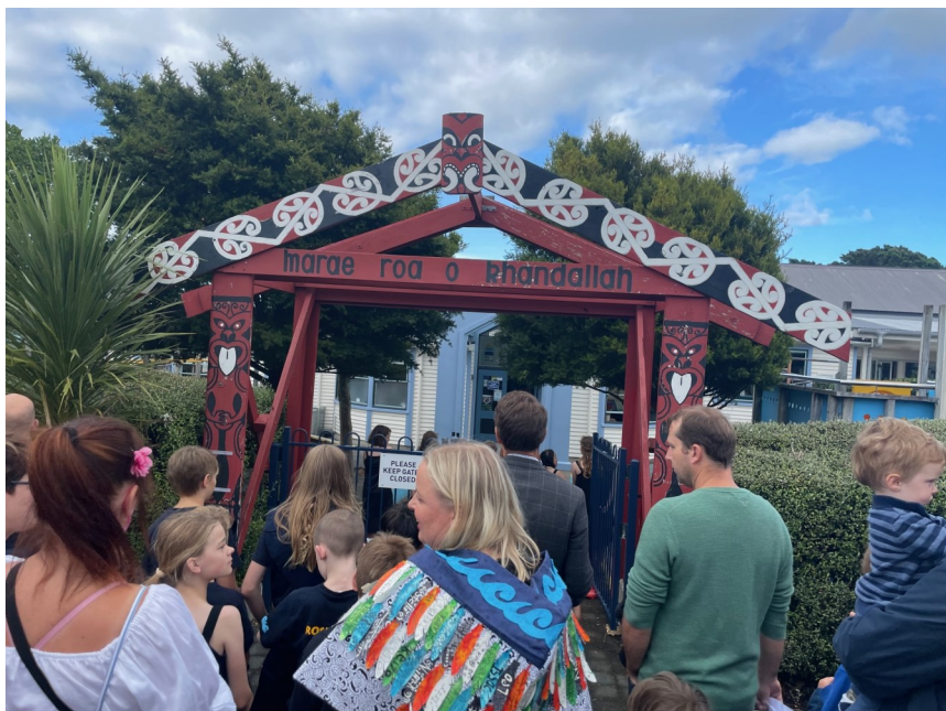
The Powhiri at Cashmere School