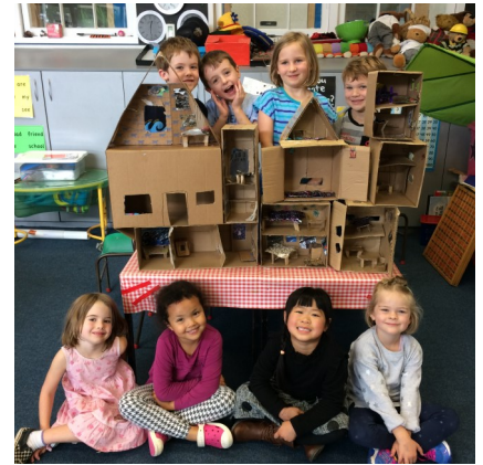
Aft with their cupboard houses