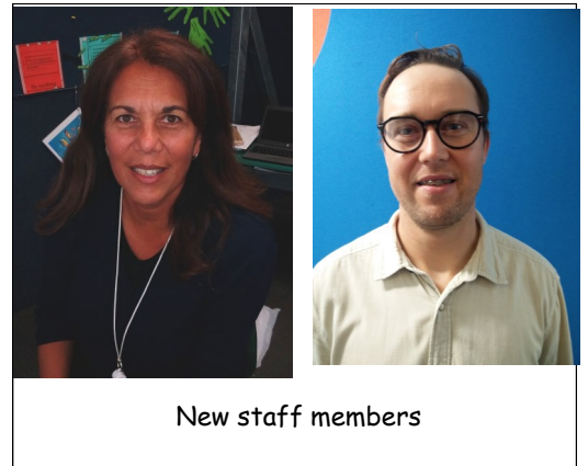
New staff members