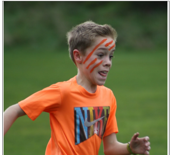
Determination on the school cross country event