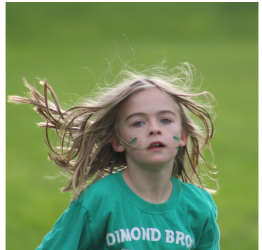
Cross country concentration