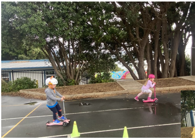
Aft and Lower Deck enjoying their scooters and skates

Thank you for supporting our school to be the vibrant, inclusive community that it is!